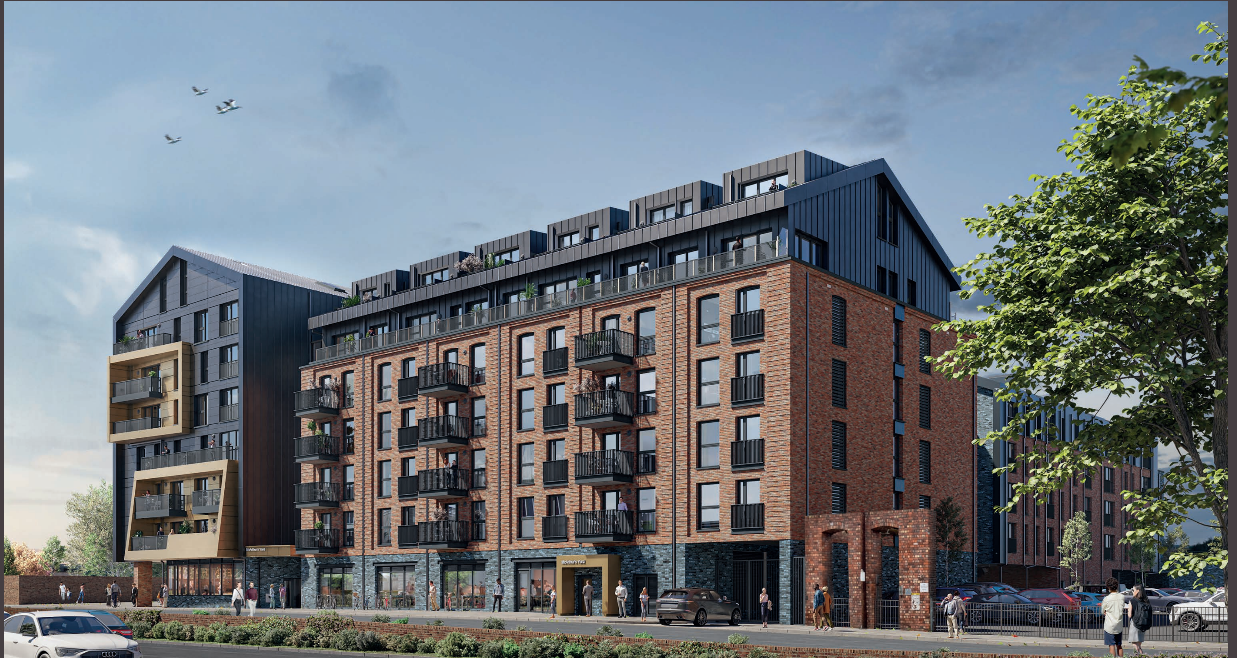
Computer generated image for illustrative purposes only.